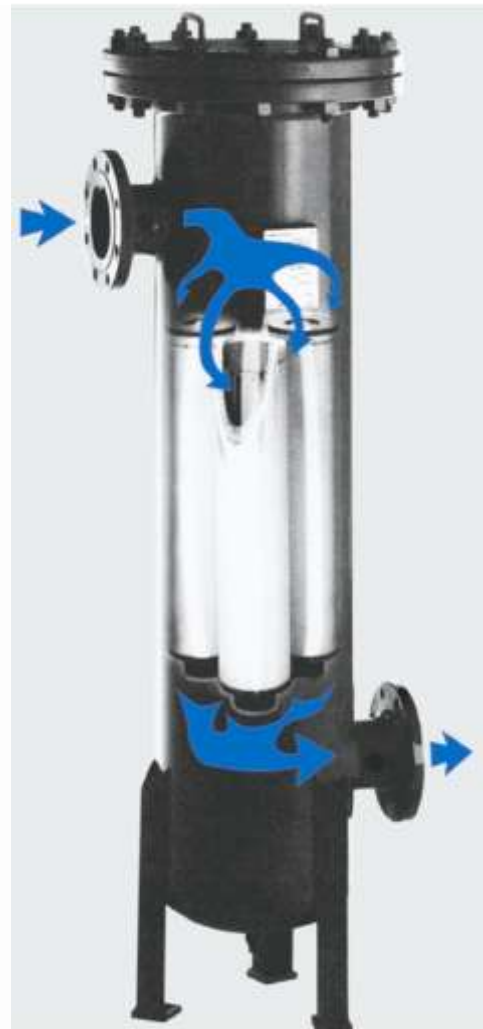
Sulfur Guard™ High-Flow Filter